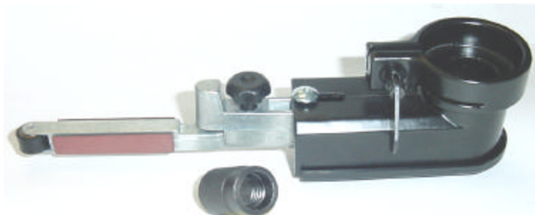
14-46-0975 BANDFILE Head Assembly

14-46-0975 BANDFILE Head Assembly is replacing the 28-50-0250 Housing found on the 6101 and 6105 BandFile.